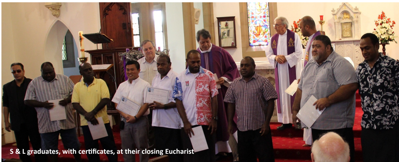
S & L graduates, with certificates, at their closing Eucharist